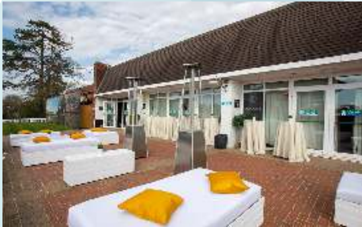
ADJOINING PATIO AREA

*The pavilion can be split into two smaller spaces.