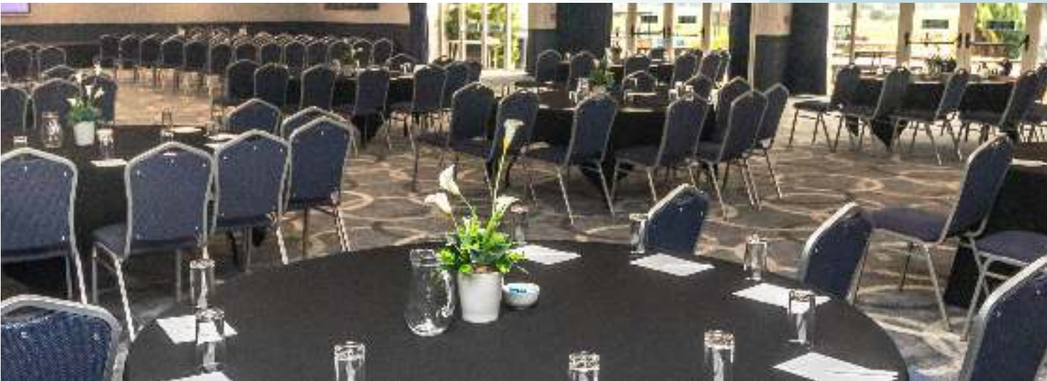
FULL PAVILION / MIXED THEATRE & CABARET STYLE