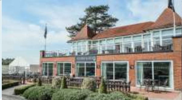
LOWER ECLIPSE TERRACE