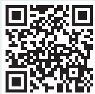
Scan to see our drone footage

Elevate any affair to soaring heights and come away feeling on top of the world.